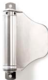
Automatic door-closer (Art. 9030 1030) Fits to the side of the door with the hinges, to close the door from a fully open position. Easy to fit. Complement this with the hydraulic shutting device described above.