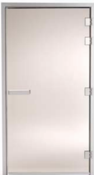
Steam Door 99 G (Art. 9091 2020) As above, but specially adapted for wheelchair access with extra wide opening and flat threshold. Frame dimensions: 1870 x 990 x 60 mm. Width of opening 880 mm.