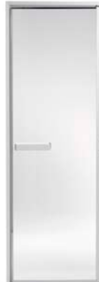
Steam Door 50 G (Art. 9091 1010) Compact model in tempered clear glass with concealed hinges. Frame size: 1855 x 635 x 43 mm. Width of opening 550 mm.