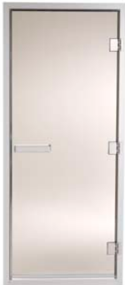
Steam Door 60 G (Art. 9091 2000) Frame size: 1870 x 778 x 60 mm. Width of opening 670 mm.