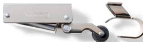
Shutting device for glass doors (Art. 9030 1010) Hydraulic construction closes glass doors gently and smoothly. May be combined with the door-closer below.